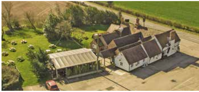
OUTDOOR COVERED TERRACE