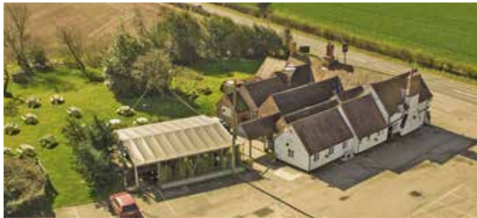
OUTDOOR COVERED TERRACE