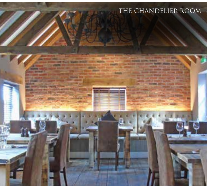
THE CHANDELIER ROOM

If you're looking to get together talk to us about your requirements. We arrange all functions on a bespoke basis with you personally. Prices depend on the size of your party and the date and time you require. Full written costs are available on request. Call to make an appointment or email functions@thefalconthatton.com