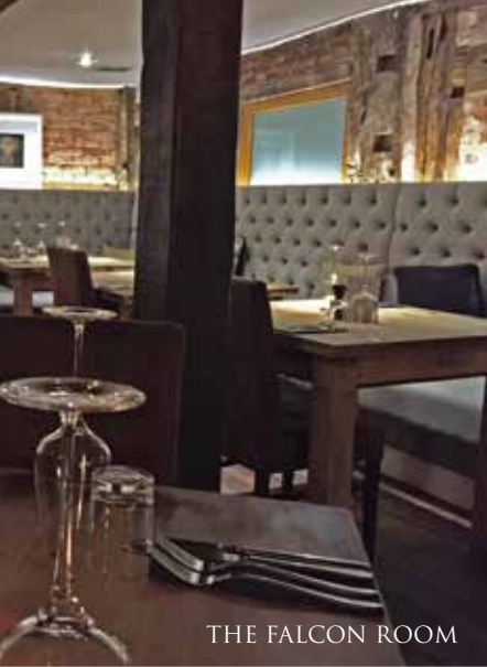
THE FALCON ROOM