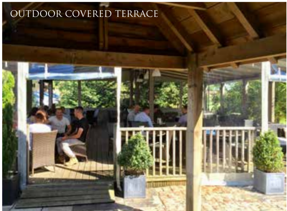
OUTDOOR COVERED TERRACE