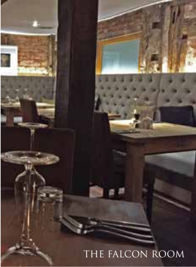
THE FALCON ROOM